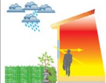
A low U-Value is ideal for all climates as it stops unwanted heat gain in summer and unwanted heat loss in winter.