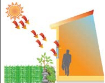
In cooler climates, a high SHGCw (as illustrated) is beneficial for north facing windows during winter, however shading will be required in summer to prevent unwanted solar heat gain. In hot climates, a low SHGCw is always ideal.